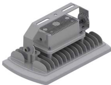
Adjustable Yoke Mount