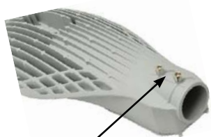
(2) 5-16" Stainless Steel Hex-head Bolts