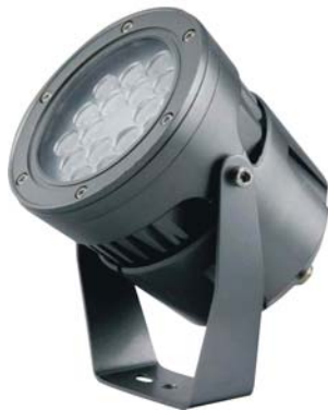
Adjustable Yoke Mount