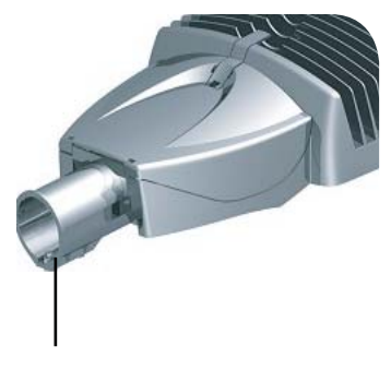
Accepts 1-1/4" - 2-3/8" O.D. Tenon or Pipe