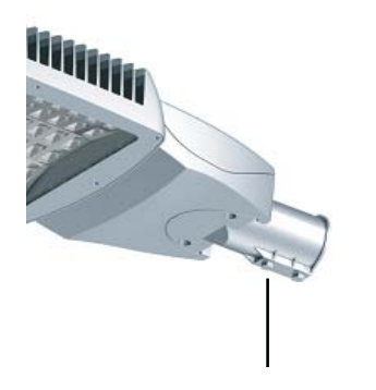
(2) 5-16" Stainless Steel Bolts